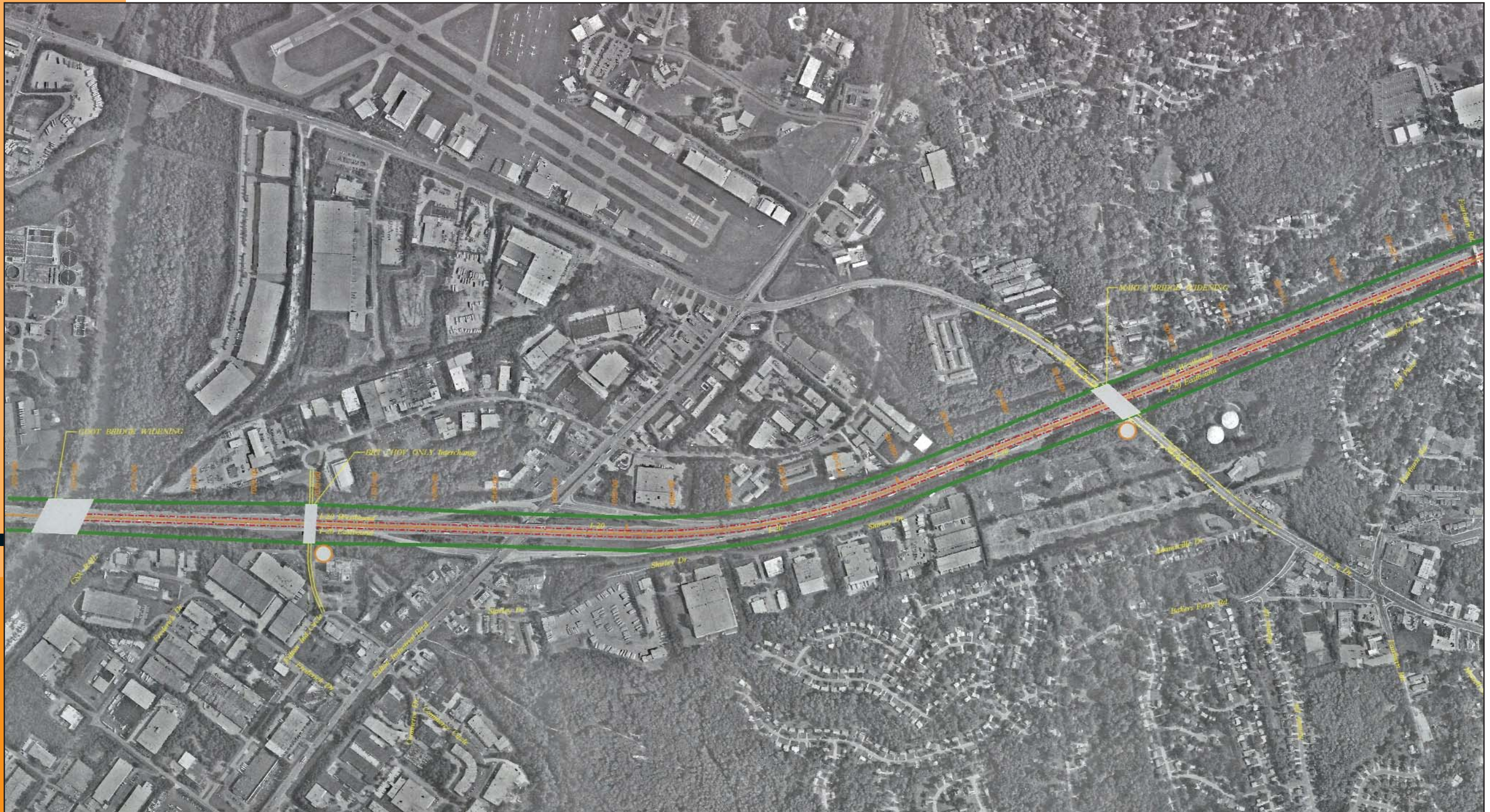
FIGURE 9.1 COMBINED ALTERNATIVE (PAGE 1 OF 2)