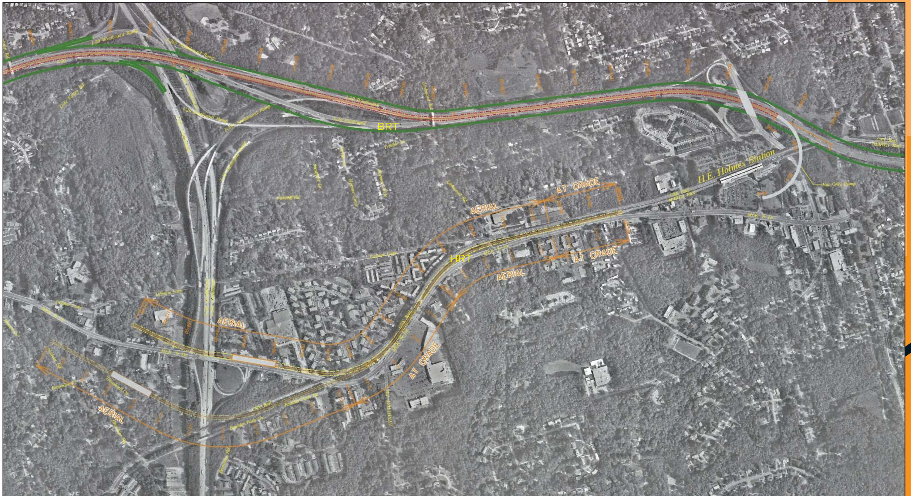
FIGURE 9.1 COMBINED ALTERNATIVE (PAGE 2 OF 2)